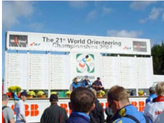
Level 3 Controllers' Course September 2005