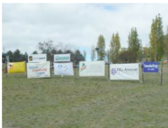
Level 3 Controllers' Course September 2005