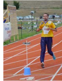
Level 3 Controllers' Course September 2005